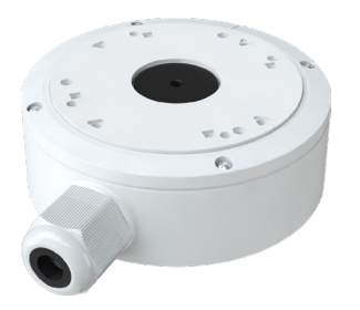
PR-JB14IP66 Large Water-proof Junction Box